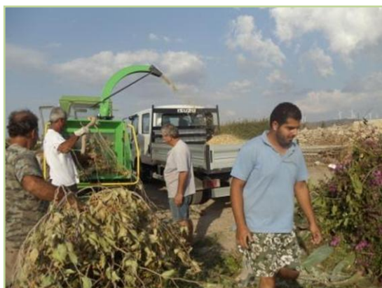
The President of Kouklia Community and colleagues working with the wood shredders.

“Our community has made sustainability a standing agenda item on our agenda. Already more than 50% of our energy production is from renewable resources, compared to the overall EU Member State target of 20% by the year 2020. During my visit to the Netherlands entitled “Opportunities for new member states”, the partners were shown Dutch footpaths and cycle tracks made from local, natural products - in this case sea-shells - instead of asphalt. I discussed whether our green, organic, agricultural waste viz. trimmings could be used as an alternative viable footpath surface to the clay we currently use. Following a positive response and realising this would also improve our waste management policy, the community decided to invest €20000 in a wood-shredder earlier this year. After several months of operation, the shredder is producing ca. 4t/hr of shredded material.